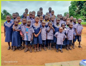
We gifted uniforms