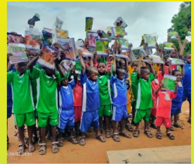
we gifted sports wears