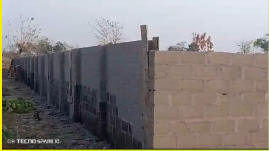
Fenced 5 acres of land

Stay tuned for more updates on this transformative project!