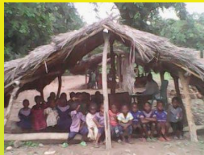
we started in tents