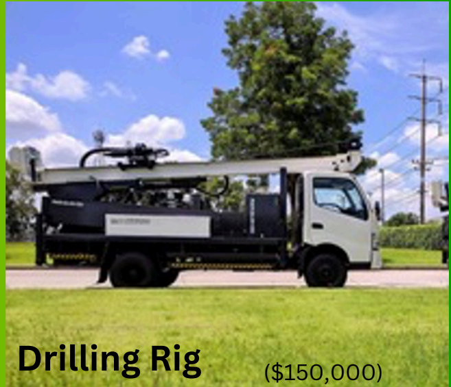
Drilling Rig ($150,000)