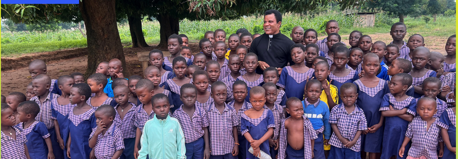
St Francis Nursery & Primary school