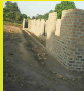
We are now building a classroom block